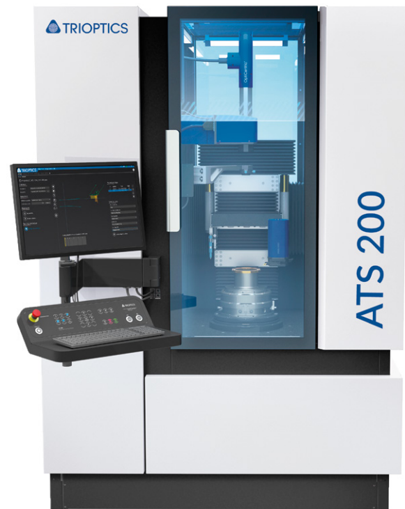
The alignment turning station ATS 200 by TRIOPTICS

The image quality of an optical system depends on the precise centering of its lenses, among other factors. In conventional pro-